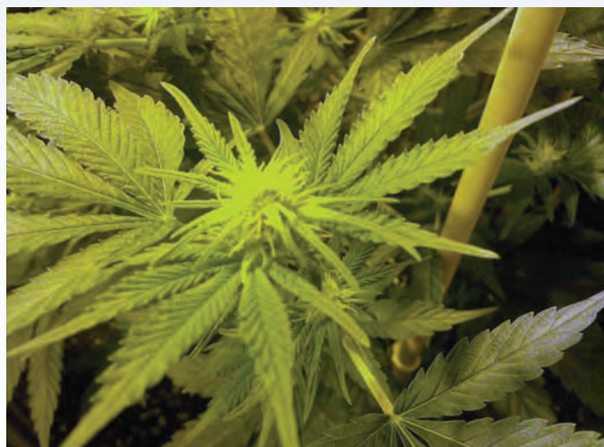
Even leaves are a useful part of the cannabis plant.

It is currently thought that raw cannabis has medicinal activity due to the presence of cannabinoid acids. All natural cannabinoids (such as THC and CBD) come from precursor carboxylic acids. This